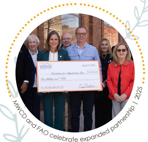
MWCD and FAO celebrate expanded partnership | 2025

Together, we are investing in the preservation of our region's natural assets – and empowering community members to become active stewards of them.