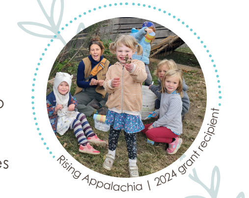
Rising Appalachia | 2024 grant recipient