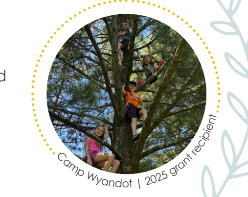
Camp Wyandot | 2025 grant recipient