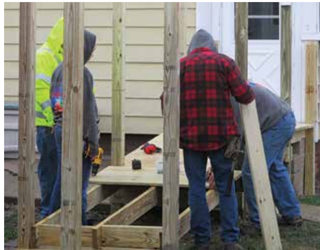
HARP Mission volunteers build a wheelchair ramp for a homebound senior citizen.

The Jimmy Wood Memorial Scholarship Fund provides scholarships to graduating New Lexington High School students who have participated for at least three years in FFA, 4-H, or athletics to pursue post-secondary education.