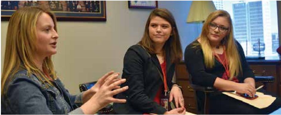
Students trained through Youth-Led Prevention meet with their representatives at the Ohio Statehouse.