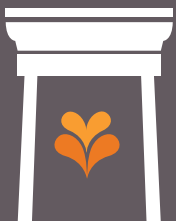
Community & Economic Development