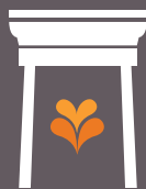
Community & Economic Development Fund