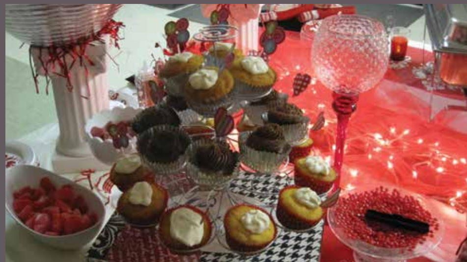
The Meigs COA now caters events, such as this Valentine themed event, to bring in revenue to support their mission.

Through this effort, the Meigs Council on Aging is receiving coaching and assistance to plan for the expansion of its catering services, and even a restaurant, as it moves into its new location in the former Middleport High School building.