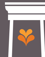
Health & Human Services