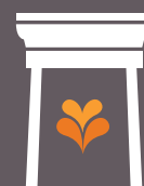
Environmental Stewardship Fund