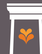
Health & Human Services Fund