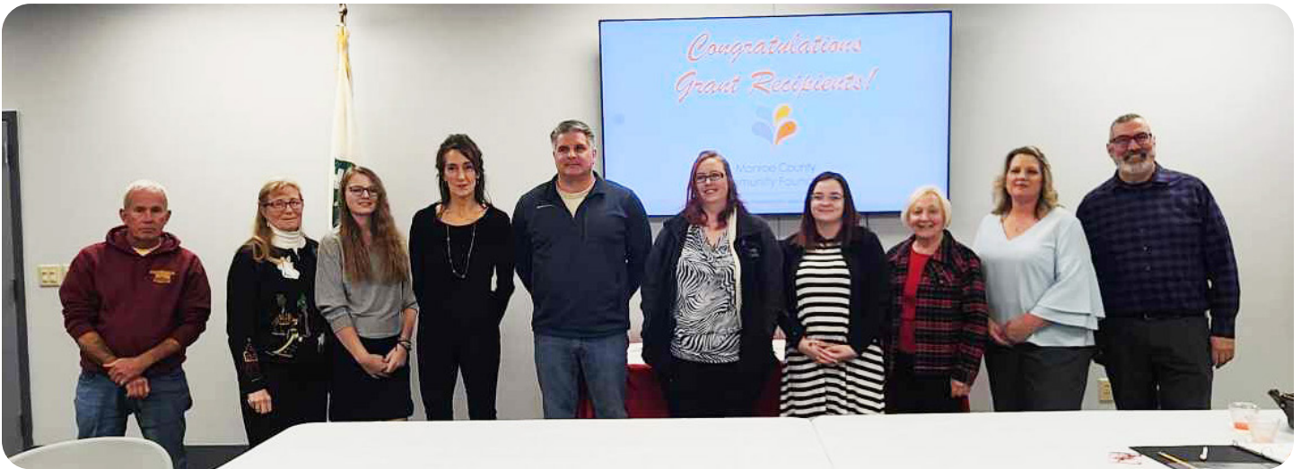
The Monroe County Community Foundation celebrated its 2023 grant recipients during an event in December. Pictured are representatives from several of the organizations that received funding.