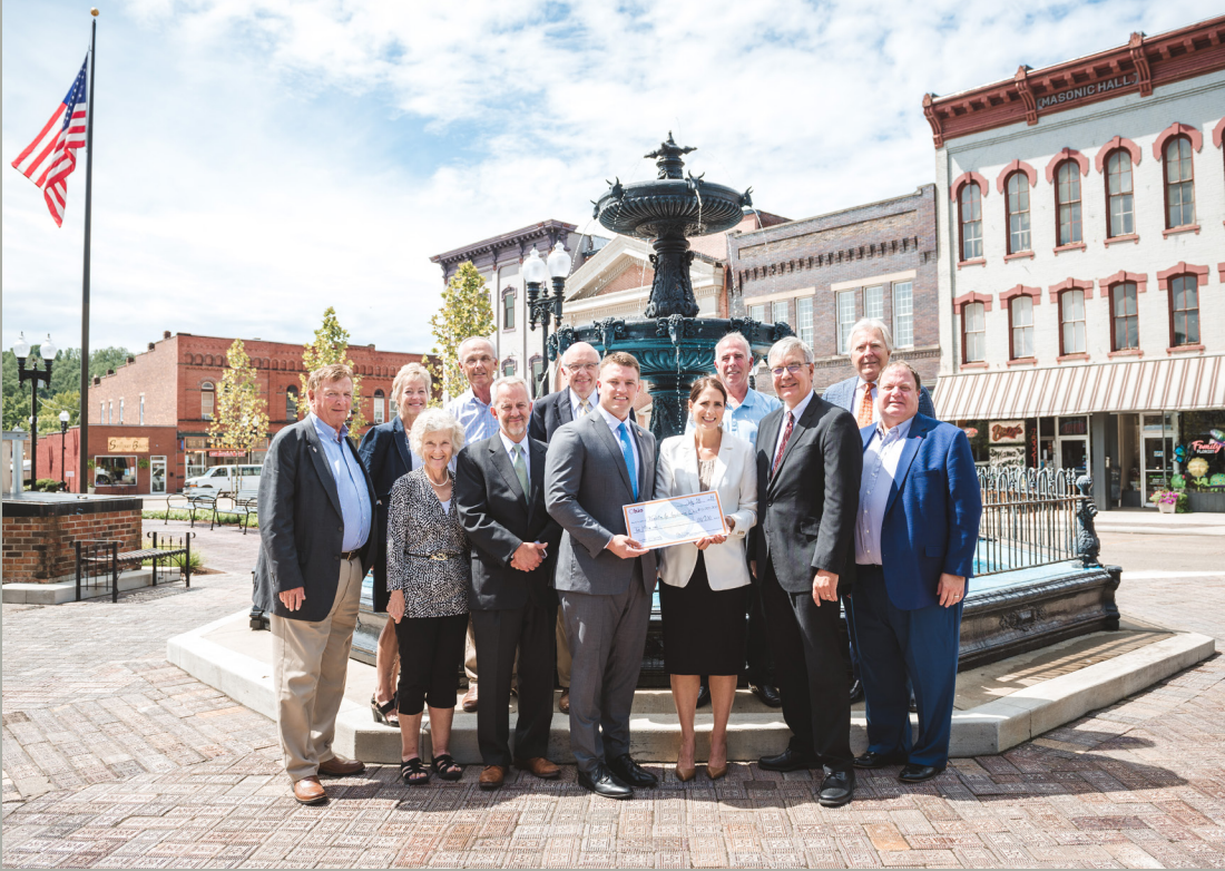
Check presentation with the FAO Board of Trustees.

This year's State of Ohio budget included $10 million for FAO's work of building endowment and creating opportunities in Appalachian Ohio!