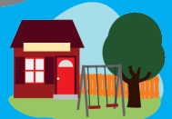
EARLY CHILDHOOD PROGRAMS