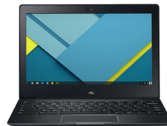
DIGITAL LEARNING TOOLS