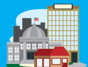
AND MANY MORE!