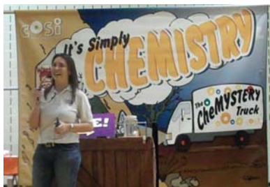
Within the 2009-2010 school year, approximately 8,000 students will engage in COSI on Wheels activities as a result of FAO's support.