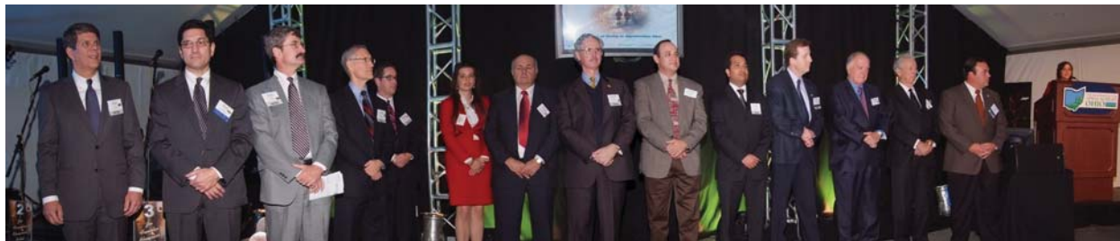
Members of ICAN! Corporate Partnership

Ohio CAT, the exclusive, authorized dealer for Caterpillar equipment and engines for most of Appalachian Ohio, has made a $250,000 commitment to invest in building the Foundation for Appalachian Ohio's capacity to create educational and quality of life opportunities. As a part of this gift, Ohio CAT joins the Foundation's ICAN! Corporate Partnership, an emerging collaboration of corporate donors, directing charitable investments through the Foundation to accelerate and sustain the creation of educational and quality of life opportunities in Appalachian Ohio. We are grateful for Ohio CAT's partnership in our work to create the educational opportunities that will ultimately lift quality of life in Appalachian Ohio. Thank you!