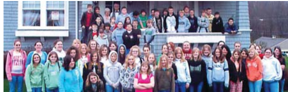
7th grade Huntington Middle School class, ICAN! Contest Field Trip Recipient, visiting John and Annie Glenn Historic Site and Exploration Center.

In meetings, small and large, we have presented the vehicle we believe FAO could be for creating educational opportunities, and then we listened. As we listened, we quickly understood: because of FAO's approach, Appalachian Ohio has unprecedented opportunity to leverage educational investments and transformation of a significance and scale never before experienced in Appalachia. As one partner said, "Because of the role FAO can play to help people accomplish what they already aspire to do, I believe I may live to see poverty significantly reduced in Appalachian Ohio."