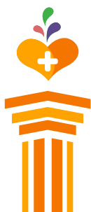
Health & Human Services

Our investments improve health, create educational opportunities, advance economic development and environmental stewardship, and provide access to arts and cultural experiences.