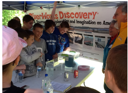
Students from Ridgewood Elementary learn about stream ecosystems during a mini-grant funded field-trip

Grants were awarded to educators and nonprofits in the region, who brought students to local streams for lessons on fishery quality and water chemistry, state parks for hands-on activities involving local bird identification and conservation, and unique geologic settings to study soil stewardship and ground-water protection, among many others.