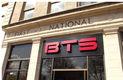
BTS Software Solutions' new location in downtown Gallipolis

The creation of a community foundation fund can lead to stronger partnerships and support across a whole county. In Gallia County, where the Gallia Community Foundation Fund was established in 2011, residents, local organizations, and entrepreneurs have taken the opportunity to partner with FAO to benefit the community in new ways.