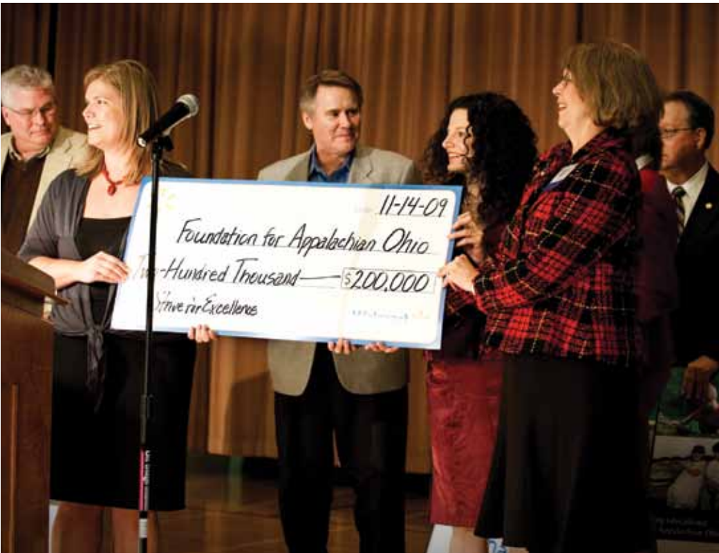
A $200,000 grant from the Walmart Foundation State Giving Program is presented to FAO Board Members

Please visit FAO’s website at www.appalachianohio.org for a complete list of 2010 Strive for Excellence grant recipients.