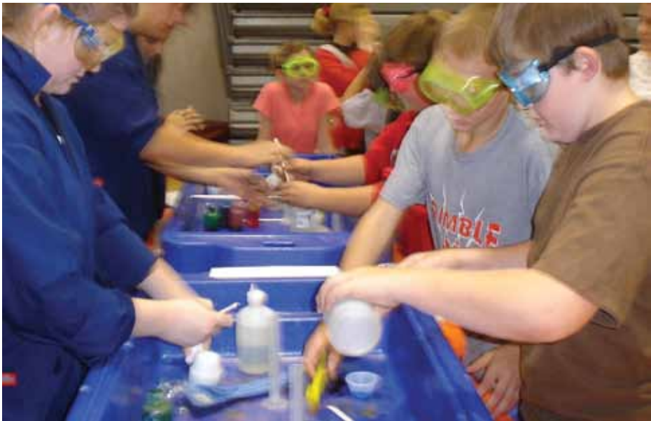
Students of Trimble Elementary engage in science during COSI On Wheels visit.

Providing COSI On Wheels enables the region’s students to access exciting science experiences and careers to inspire further educational studies. While just over $1,000, the cost is often challenging for many of Appalachian Ohio’s schools. To provide 20 COSI On Wheels visits this past year, FAO partnered with Diagnostic Hybrids: A Quidel Company; Oxford Resource Partners, L.P; Tata Sons Limited; and the Cambridge City Schools Alumni and Friends Endowed Education Fund. FAO will continue growing partnerships to provide traveling education opportunities to instill new skills and excitement in the Science, Technology, Engineering, Math and Medicine (STEMM) fields.