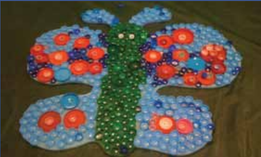
Bishop Flaget students creating beautiful bottle cap art, made possible by I'm A Child of Appalachia Writing Contest® award.

Finally, the grants supported the Bishop Flaget music department's production of Alice in Wonderland , by providing costumes for the fifth through eighth graders telling the story of Alice and her friends.