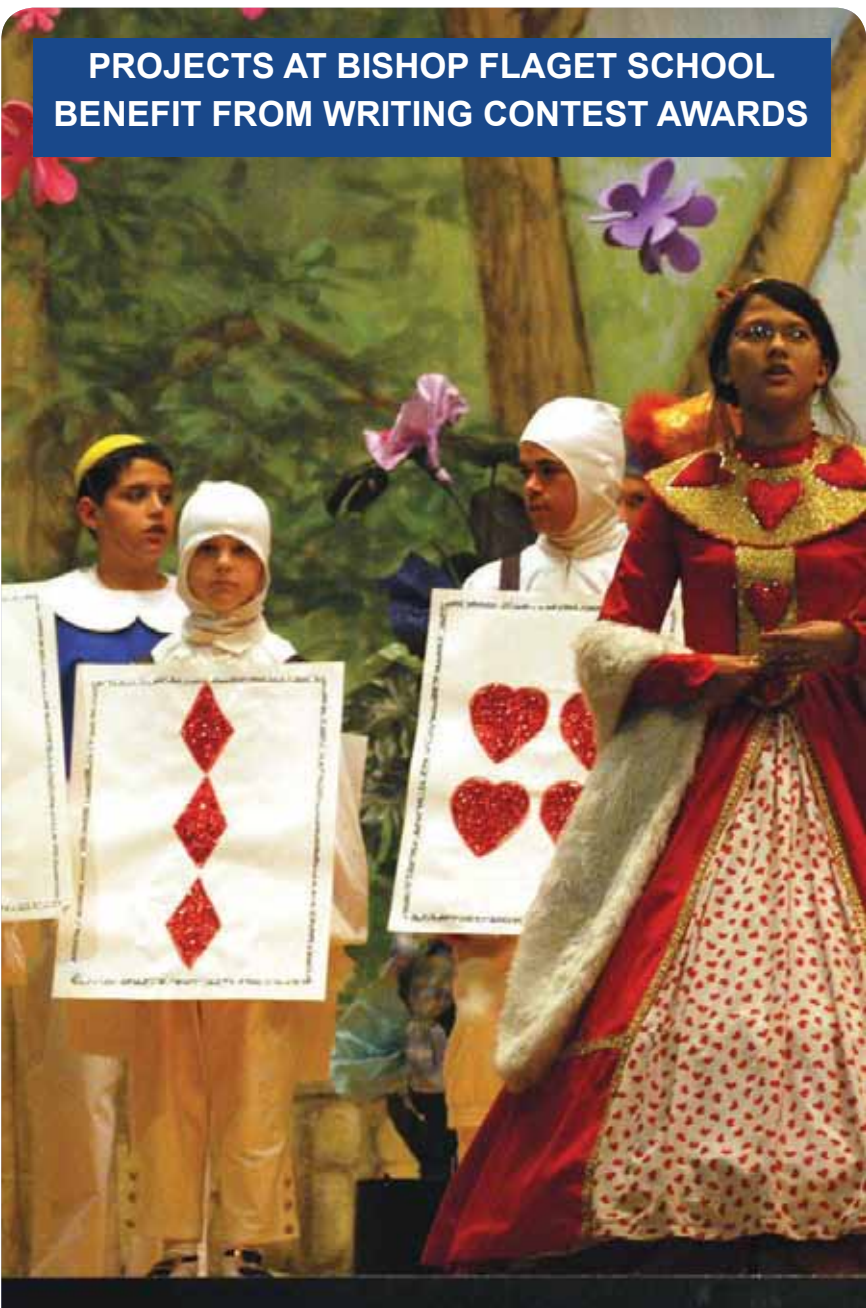
Alice in Wonderland production at Bishop Flaget.