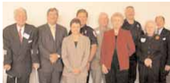
Philanthropy Day Luncheon honorees

Nine individuals and/or couples were honored for their generous and noteworthy contributions to their communities. Each was introduced by their nominator, and after a brief review of their philanthropic efforts, those present were