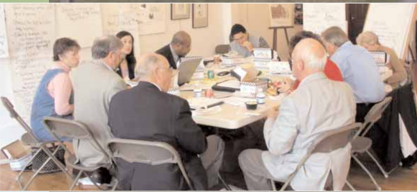
FAO Board at work