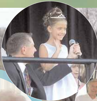
2006 Little Miss Parade of the Hills contest