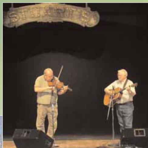
Old-Time Fiddlers' Contest

Leaders from throughout Ohio came together July 25 and 26 for the Share Your Heritage "Realizing the Dream of the Appalachian Highway" Workshop, a strategic planning event to discuss developing heritage tourism and marketing strategies for Southern Ohio. The workshop was hosted by the Ohio Valley Resource Conservation and Development (RC&D) Council and was held at OSU South Centers in Piketon, Ohio.