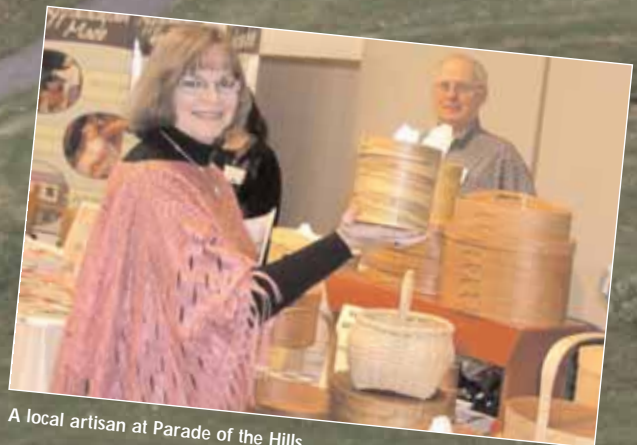
A local artisan at Parade of the Hills