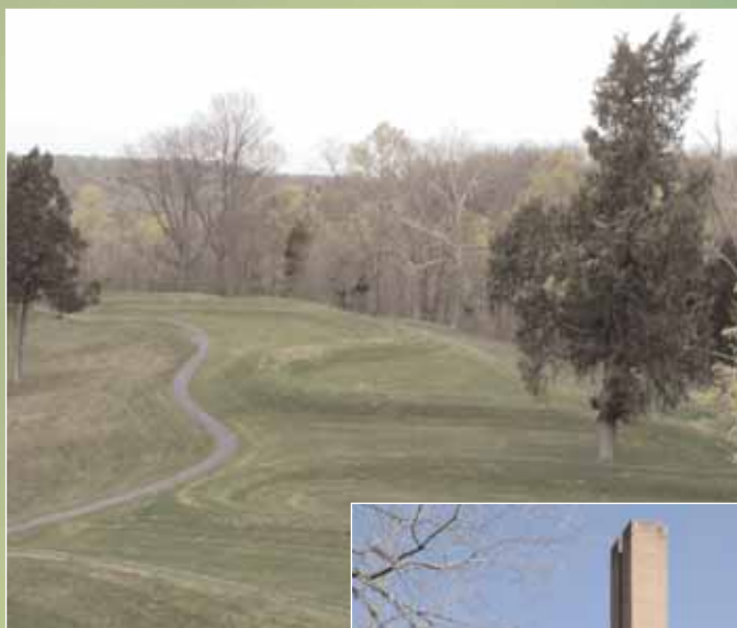
Serpent Mound Adams County, Ohio