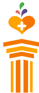
Health & Human Services

Our investments improve health, create educational opportunities, advance economic development and environmental stewardship, and provide access to arts and cultural experiences.