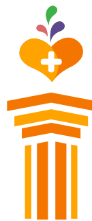
Health & Human Services

Our investments improve health, create educational opportunities, advance economic development and environmental stewardship, and provide access to arts and cultural experiences.