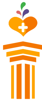
Health & Human Services

Our investments improve health, create educational opportunities, advance economic development and environmental stewardship, and provide access to arts and cultural experiences.