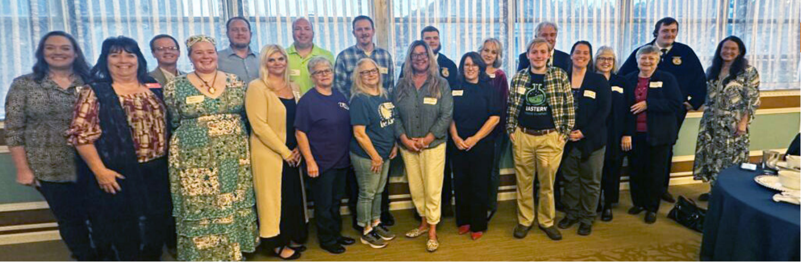
The Meigs County Foundation announced and celebrated its 2023 grant recipients at a reception held at the Blakeslee Center. Pictured at the event are foundation committee members and grant recipients.