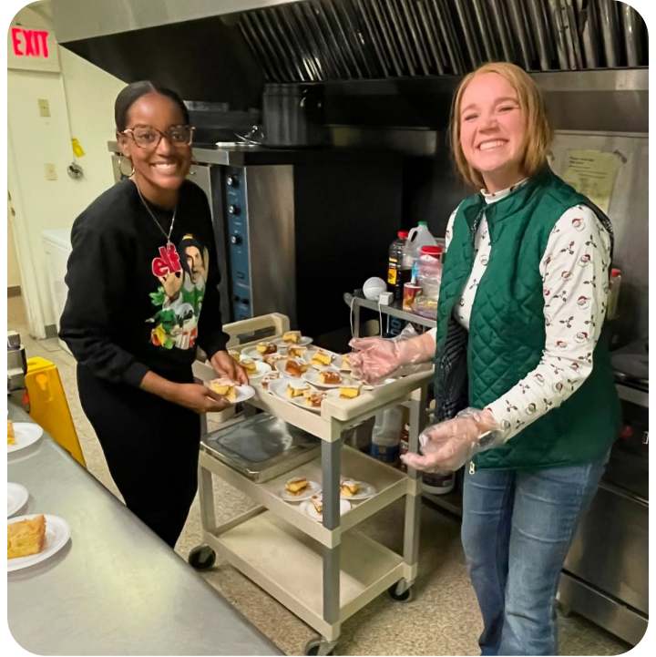
A 2024 LCCF grant is helping Third and Center provide nutritious meals to seniors participating in programming at the Ironton Senior Center.

Young Life (Proctorville) provides a positive and nurturing space where Lawrence County youth can build relationships, develop leadership skills, and grow personally and spiritually. This grant is helping to maintain and grow the organization's weekly club meetings, providing a consistent source of support, encouragement and guidance that helps teens navigate the challenges of adolescence.