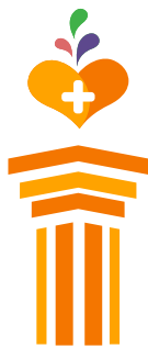
Health & Human Services

Our investments improve health, create educational opportunities, advance economic development and environmental stewardship, and provide access to arts and cultural experiences.