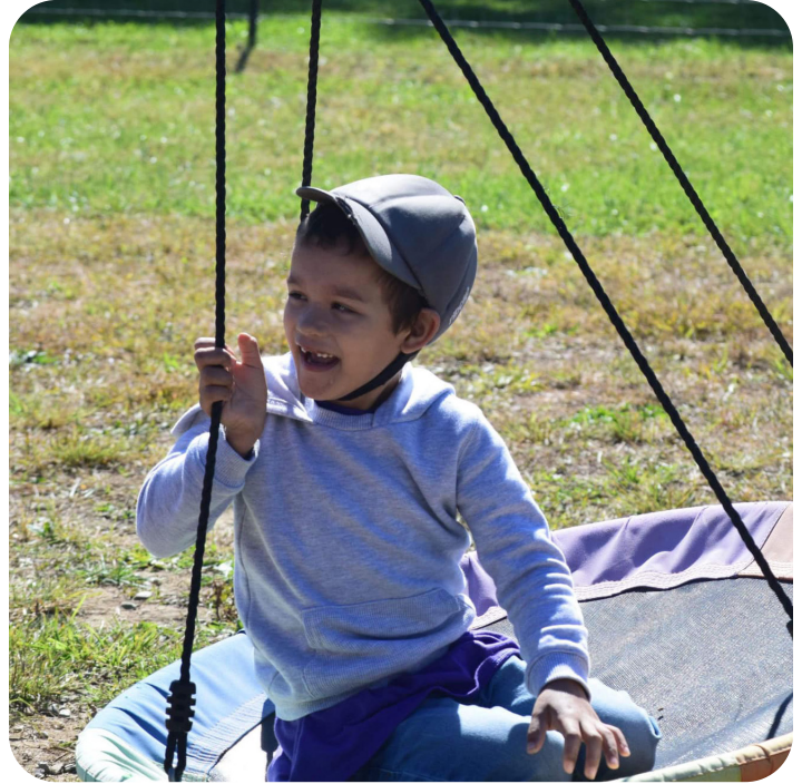
Students at the Open Door School will be enjoying a little more time on the playground, thanks to an LCCF grant to upgrade and add swings.

Each week, RLB Ministries' Backpack Buddies program provides 550 children in 19 Lawrence County schools with meal bags to nourish them over the weekend. The nonprofit also operates an emergency food pantry, helping families who find themselves in crisis situations. This grant is funding the purchase of food for this much-needed assistance.