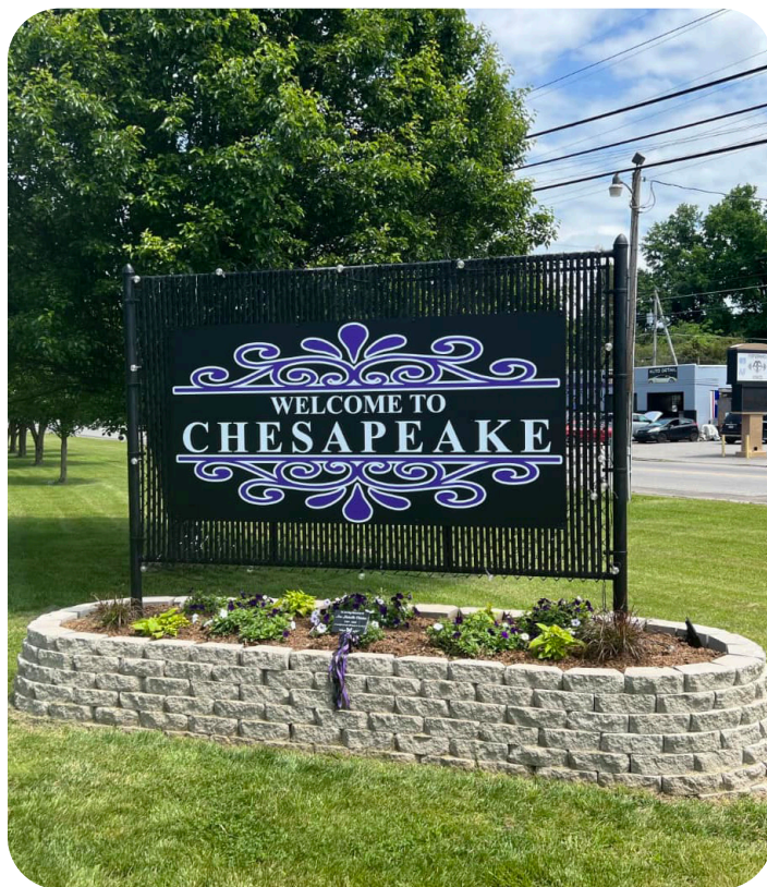
In 2019, a group of volunteers united to form Hometown Love of Chesapeake and has been enhancing and beautifying their hometown ever since – this year with the help of an LCCF grant.

LCCF is helping to finance the 2024 inspiHER Girls Leadership Retreat at South Point Middle School. Lawrence County fifth- through eighth-grade girls will spend a day immersed in the skills, resources and tools needed to overcome challenges and become confident leaders in their schools and in the community. Approximately 20-30 Lawrence County high-school aged girls will be trained to serve as mentors for the retreat.