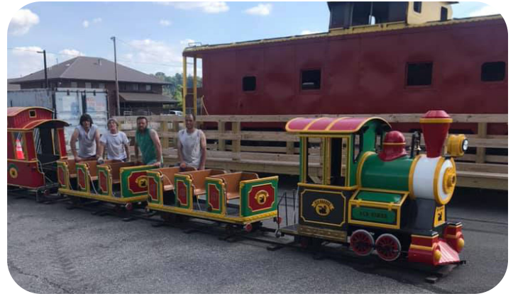
The Friends of Ironton is installing a children's train ride this year, and an LCCF grant is helping secure some artsy storage for the ride.

Downtown Ironton's Friends Park continues to flourish – thanks to community collaboration and generosity. This year will see the addition of a children's train ride, courtesy of the Friends of Ironton, to complement the children's splash park. This grant is helping to purchase storage containers for the train ride. These containers will be painted with Appalachian-themed murals, bringing art, community pride and a touch of history to this Lawrence County destination.