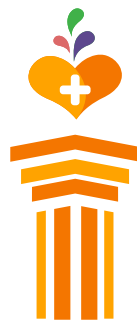
Health & Human Services

Our investments improve health, create educational opportunities, advance economic development and environmental stewardship, and provide access to arts and cultural experiences.