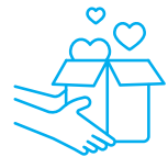
QUALIFIED CHARITABLE DISTRIBUTIONS FROM IRAs

Gifts of all sizes and kinds make a difference!