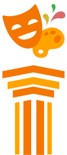
Arts & Culture

With the support of our donors, we award grants annually to nonprofit and public organizations for projects and programs that advance opportunities across five funding areas, known as our Pillars of Prosperity.