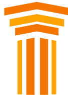
Health & Human Services

Our investments improve health, create educational opportunities, advance economic development and environmental stewardship, and provide access to arts and cultural experiences.