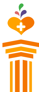
Health & Human Services

Our investments improve health, create educational opportunities, advance economic development and environmental stewardship, and provide access to arts and cultural experiences.