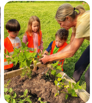
Logan Head Start students help plant pollinator gardens on HAPCAP property in Hocking County in 2023 – a project funded by a 2022 grant from HCCF.