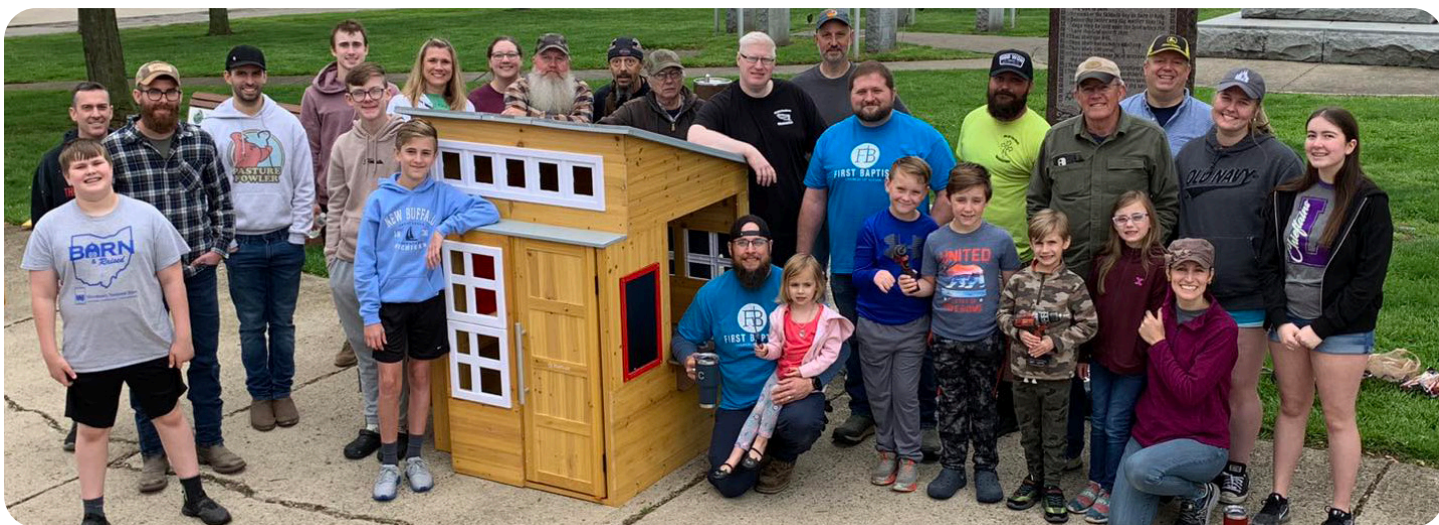
Southern Ohio Fishers of Men Association/Out of the Boat Ministries and community members held the first playhouse build in April 2023.