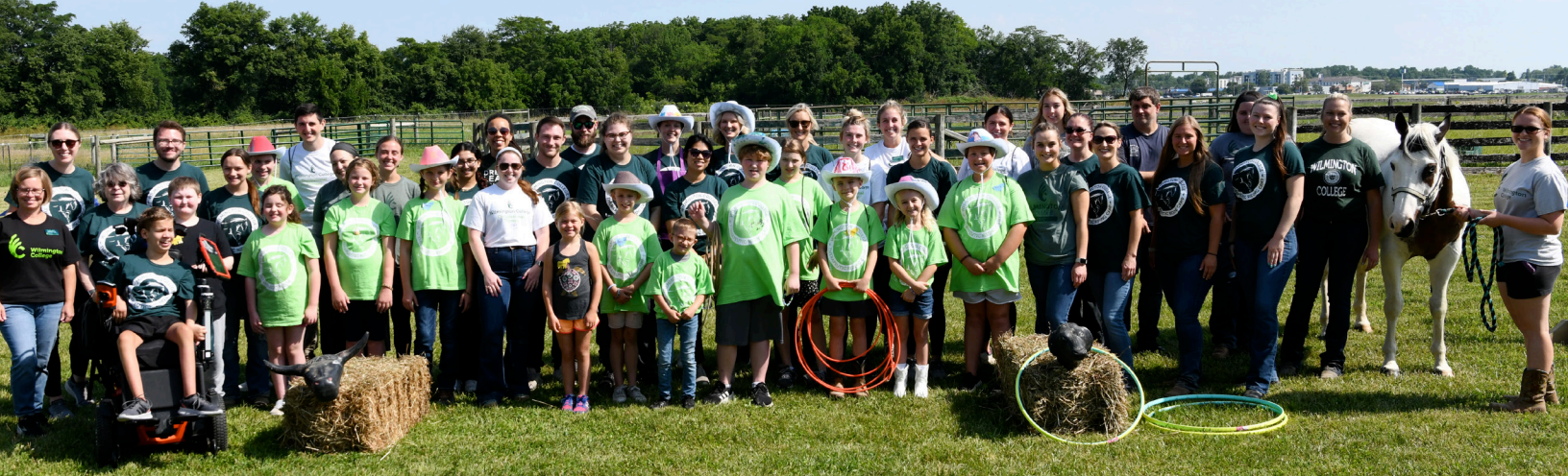
In July 2023, Highland County children with disabilities participated in Wilmington College's summer therapeutic horse-riding camp – thanks to funding provided by a 2022 HCCF grant. The five-day camp offered kindergarten through sixth-grade youth a recreational and therapeutic experience.