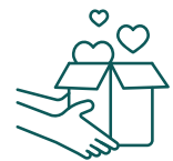
QUALIFIED CHARITABLE DISTRIBUTIONS FROM IRAs

Gifts of all sizes and kinds make a difference!