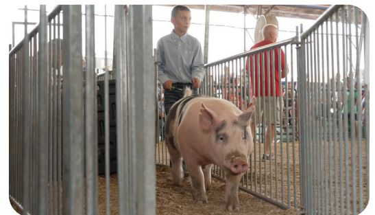
2023 saw GCF debut its Fill the Freezer campaign, an innovative, community approach to fighting hunger in Gallia County.