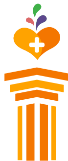
Health & Human Services

Our investments improve health, create educational opportunities, advance economic development and environmental stewardship, and provide access to arts and cultural experiences.