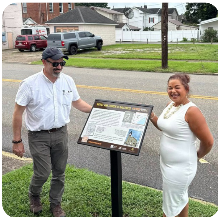
In 2025, the John Gee Black Historical Center, which preserves the history and legacy of Bethel A.M.E. Church of Gallipolis, was added to the National Park Service's National Underground Railroad Network to Freedom. Since its founding in 2020, AACF has awarded four grants to support the center and its mission.

Since 2019, the Kool Boiz Foundation Young Men's Empowerment Series Mentoring Program has provided developmental assistance – including workshops on leadership, entrepreneurship, financial literacy and a successful mindset – to hundreds of boys and young men of color in Youngstown. This is the fourth year an AACF grant is investing in the program and the future success of our young people.