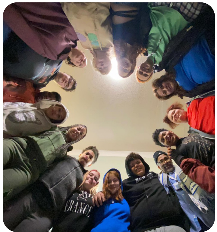
Youth in the Sycamore Volunteer Service Corps Mentoring Program are a visible force for good in Jefferson County. In 2025, their community service included distributing meals to children, helping an elderly resident relocate to a new home in the middle of winter and much more.

Plant Thee Seed Ministries launched a new summer youth development program in Trumbull County that spans creative expression, academic enrichment and science discovery, character building, physical wellness, mentorship, and community and family engagement. This grant helped provide some of the program's healthy meals, curriculum and supplies.