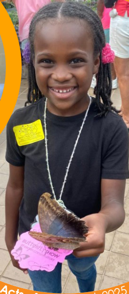
Sistah's Acts of Kindness | 2025 grant recipient