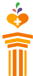
Health & Human Services