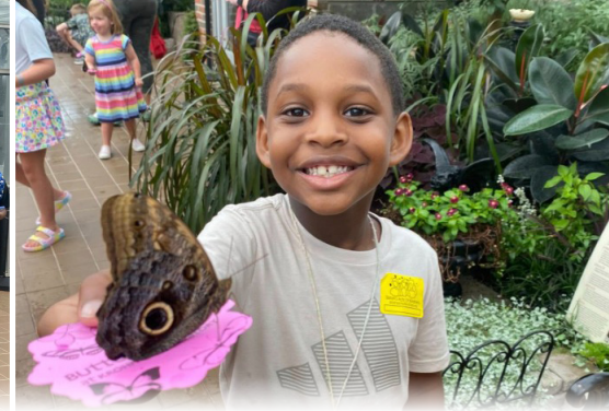
Children served by Sistah's Acts of Kindness enjoy some summer fun, courtesy of the nonprofit and its supporters. A 2025 AACF grant helped support the nonprofit's back-to-school event and other programming.