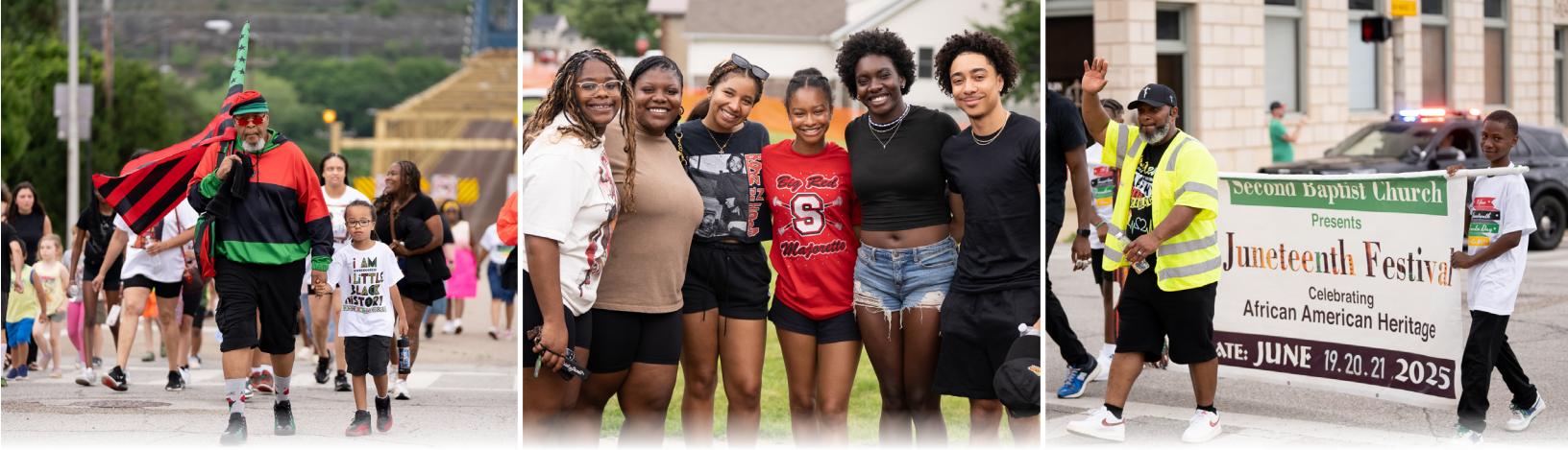
Second Baptist Church of Steubenville added a new element to its Juneteenth celebration in 2025 – a Juneteenth parade. A grant from AACF funded the parade, extended the opening ceremony and helped with entertainment expenses for the three-day celebration.