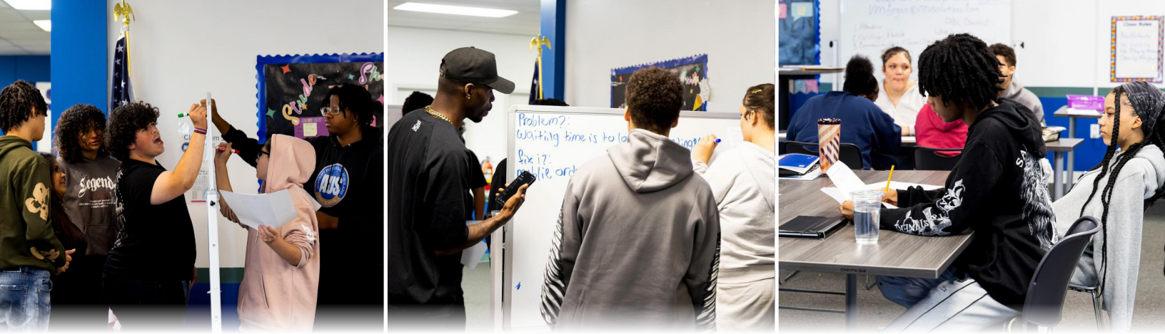
Students from the National Center for Urban Solutions in Youngstown participate in Hyer Merit Association's Life Hacks, a training program that teaches them skills they can add to their resumes and provides them tools to manage responsibilities and ease the pressures that come with growing into adulthood.