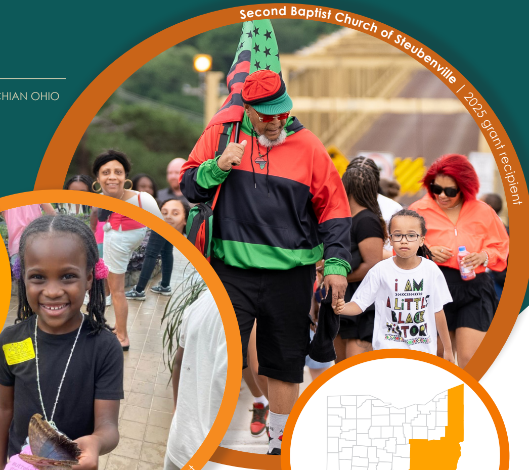
Second Baptist Church of Steubenville | 2025 grant recipient