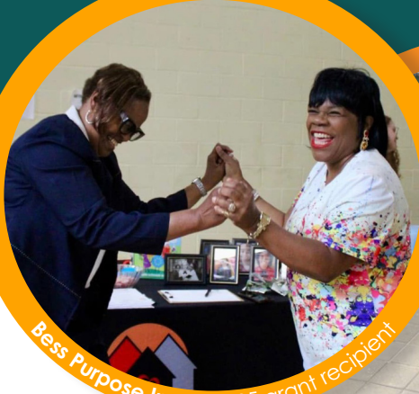
Bess Purpose Inc. | 2025 grant recipient

An affiliate of FOUNDATION FOR APPALACHIAN OHIO