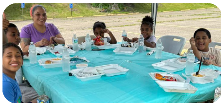
Youngstown-area residents enjoy Thrive Mahoning Valley's June 2025 Thrive Thru, a free monthly drive-through community meal initiative. The new program provides nutritious meals in an area designated as food insecure while building community connections.

In 2026, the Underground Railroad Museum in Belmont County will hold its first Flight to Freedom Adventure Race, a triathlon recreating the historic trek freedom seekers made and raising awareness of the historical significance of the Underground Railroad in the Ohio Valley. This grant is supporting the inaugural event – and an organization dedicated to preserving the past for future generations.