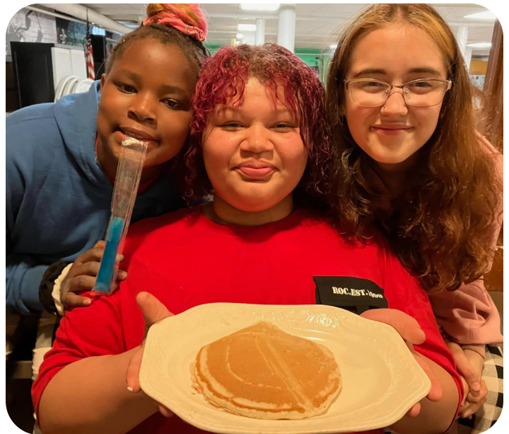
Approximately 50 students, ages 10-18, participate in the Steubenville-based Sycamore Volunteer Service Corps Mentoring Program, where they develop skills while serving their community. The program is being supported by a 2024 grant from AACF.

Signal Ohio strives to provide all Ohioans with the news and information they need to thrive, with an emphasis on underserved regions known as “news deserts” – often in rural communities. This grant is helping to fund an assessment of news and information needs in Adams, Lawrence, Pike and Scioto counties with a goal of identifying how to fill information gaps.