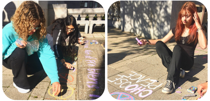
Local students chalk the walk outside the Mahoning County Courthouse during Mahoning Valley Sojourn to the Past's 2024 Non-Violence Week.

Mahoning Valley Sojourn to the Past has been educating local residents since 2007 on historic and modern civil rights issues and social and racial justice. This grant is supporting its Racial Justice Education for Mahoning Valley program, including Non-Violence Week; Freedom School, a summer program for students in grades 4-9; and community education events throughout the year.