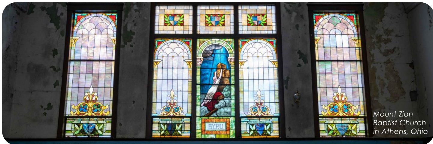
Mount Zion Baptist Church in Athens, Ohio

This grant is helping to put Mount Zion Baptist Church in Athens back on solid footing by assisting with repairs to the basement. The work is part of a plan to restore the historic Black church and transform it into the Mount Zion Black Cultural Center, a multi-use community center.